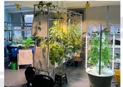
Sustainable Urban Farming Hydroponics Lab