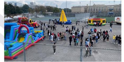
Annual Rachel Carson HS Homecoming Carnival