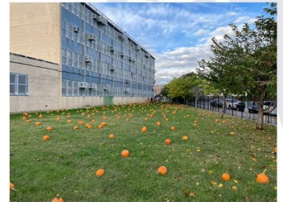
Annual Rachel Carson HS Fall Pumpkin Patch