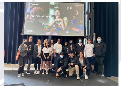
RCHS Students who presented their HE 3 AT projects at New Lab